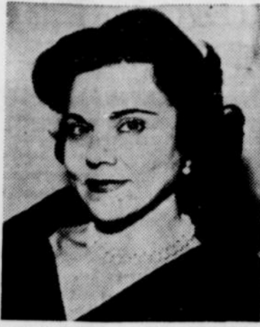
Ann Landers, popular columnist who aids thousands with their personal problems each year, is chairman of the 1963 Christmas Seal Campaign.