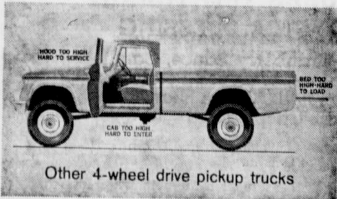
Other 4-wheel drive pickup trucks