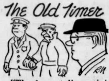
"The deepest disappointment comes to those who get what is coming to them."