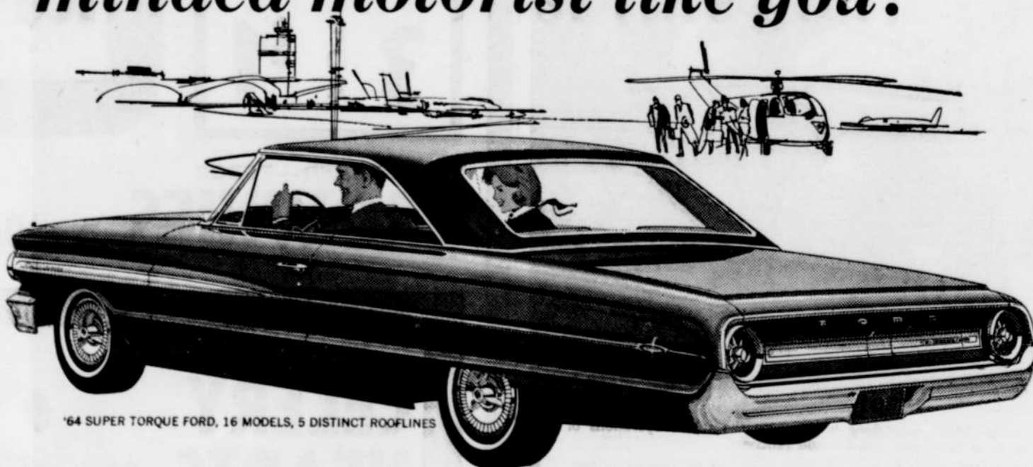
'64 SUPER TORQUE FORD, 16 MODELS, 5 DISTINCT ROOFLINES

How many miles will it take to convince a hard-headed, tough-thinking, value-loving, hokum-proof, sales-resistant, quality-conscious, fair-minded motorist like you?