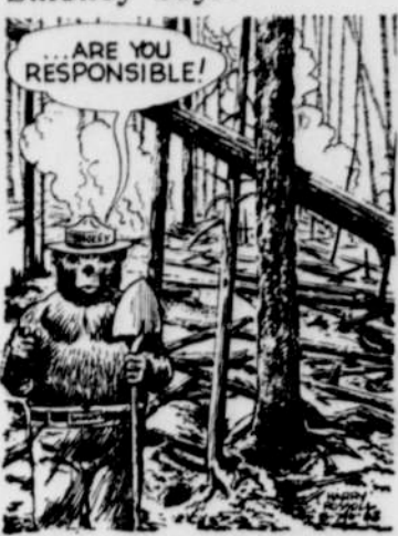
Forests destroyed by fire are monuments to human carelessness!