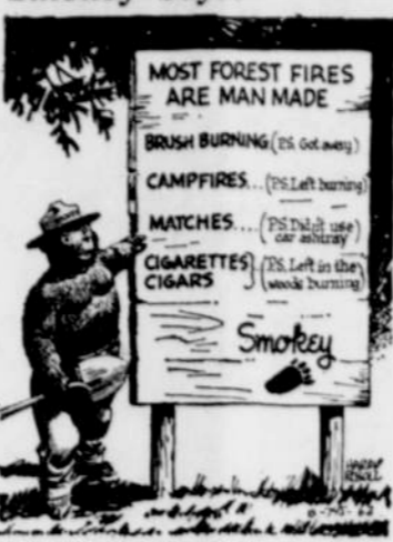
Fire won't start unless YOU allow it!