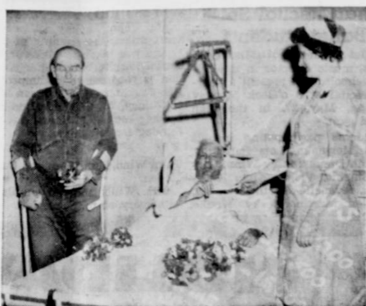
THE RED CREPE PAPER MEMORIAL POPPIES worn throughout the nation on Poppy day are made by veterans in hospitals and work shops in 40 states. These disabled servicemen are paid for each hand-made poppy they make, and the materials are furnished free by the American Legion auxiliary in the states where the hospitals are located.

Keep trying. It's only from the valley that the mountain seems high.