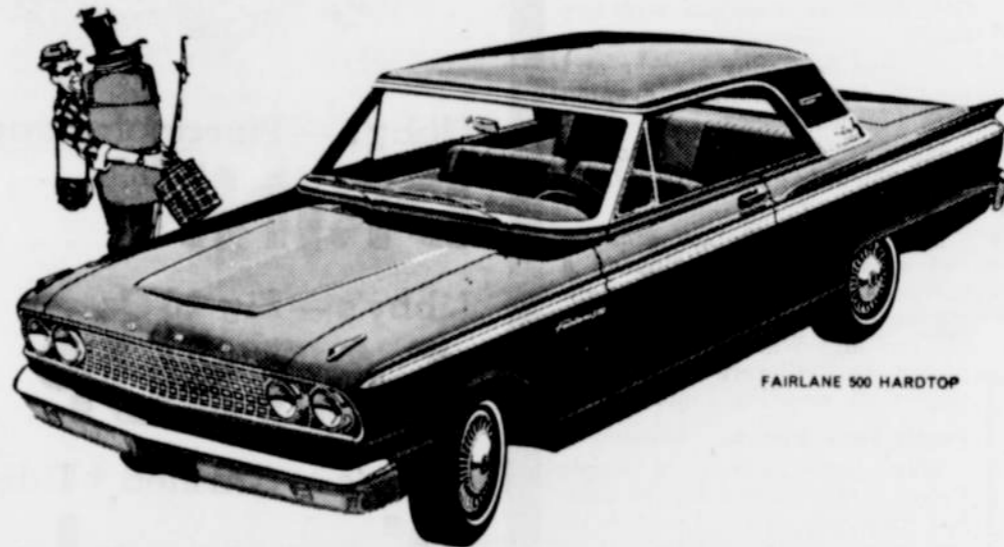
FAIRLANE 500 HARDTOP

EVERLASTING CONCRETE LAWN ORNAMENTS Bird Baths — Wishing Wells — etc. 18 East Second Street Nyssa, Oregon