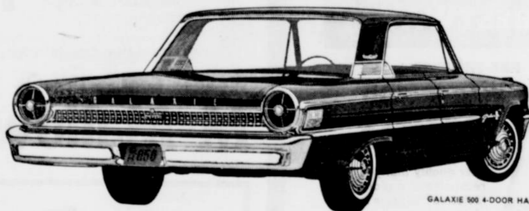
GALAXIE 500 4-DOOR HARDTOP

How can you lose with a winning deal like this? We're celebrating Ford's winning streak in total performance tests from coast to coast! Offering special high trade-ins on Ford's winning hardtops, wagons, convertibles! So you can