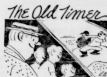
"Night baseball has cut way down on the number of grandmothers' funerals office boys have to attend."