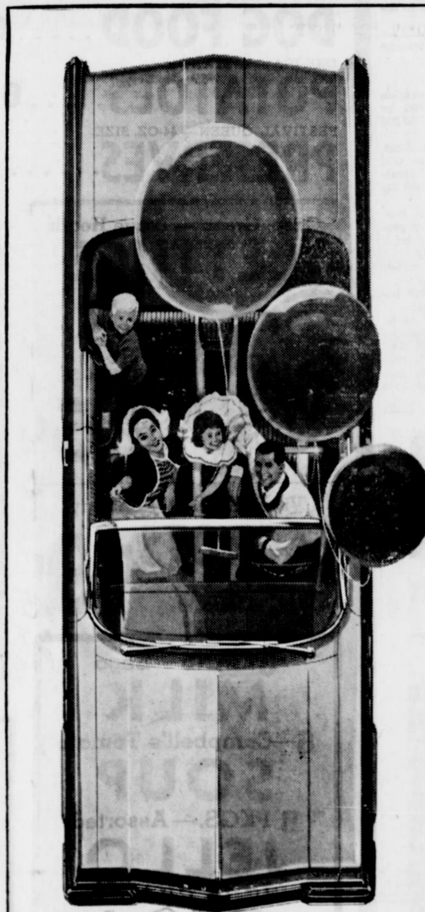
White choice of full-size LeSabre models: Sedan, Hardtop, Wagon and the Convertible shown here.

Lowest cost $1 for control returns $15 extra profit per acre!