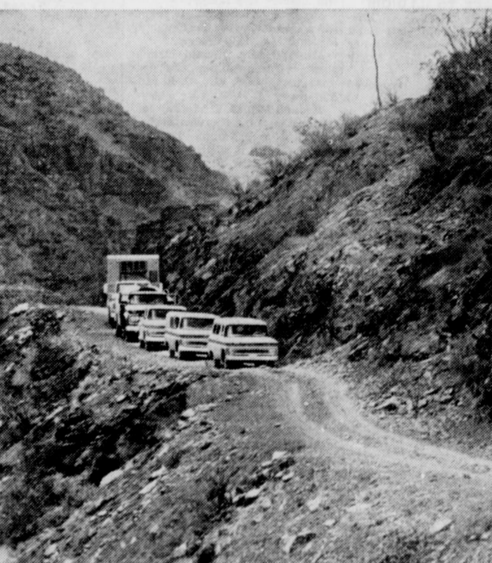
Sometimes the caravan crept along for hours in low gear. It took 17 days to go 1,066 miles! This is the road near Loreto.

...THE ONES THAT WHIPPED THE BAJA RUN...TOUGHEST UNDER THE SUN... TO SHOW THE WORTH OF NEW ENGINES, FRAMES AND SUSPENSIONS!