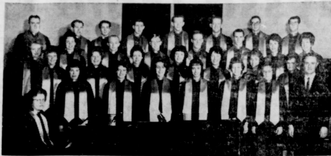
MEMBERS OF THE CRUSADER CHOIR from Northwest Nazarene college in Nampa will appear Sunday morning at Nyssa Church of the Nazarene. The students will spend the entire 11 o'clock worship service presenting their message in song, prior to a tour of the Northwest.