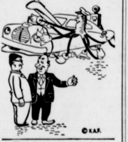
"Best dogged service man I ever saw."

Children through three years of age will graduate into the beginners department.