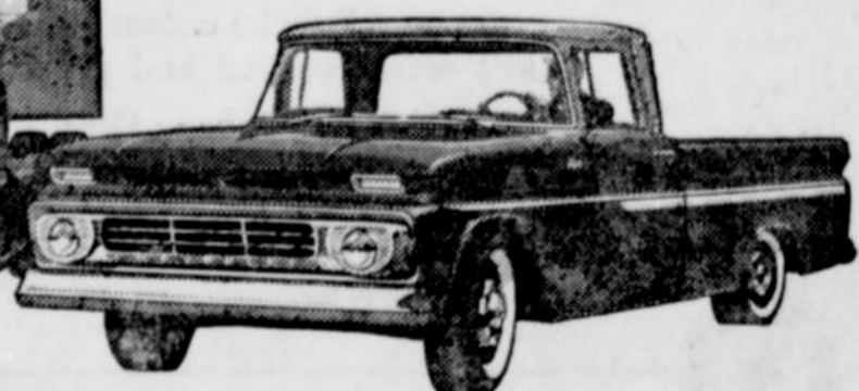
New FLEETSIDE PICKUP. Most modern version of America's most popular pickup.

See your local authorized Chevrolet dealer