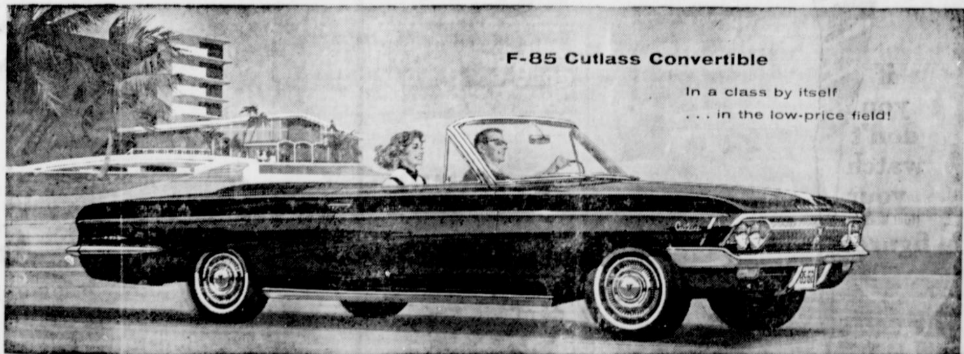
F-85 Cutlass Convertible

In a class by itself... in the low-price field!