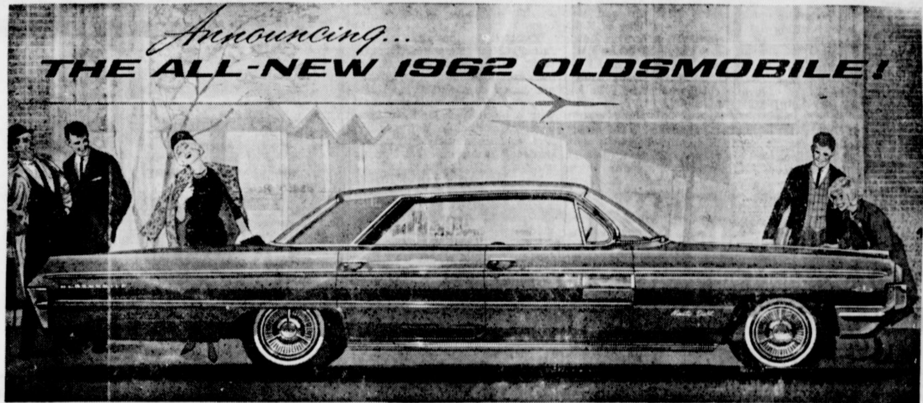
Elegant Ninety-Eight Holiday Sports Sedan

Saturday, Sept. 23—6 to 9 p.m. At Adrian Grade School Cafetorium. Sponsored by Adrian Legion and Auxiliary