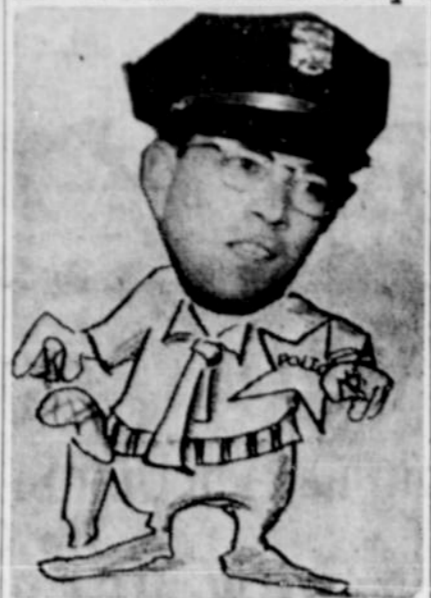
! * @ & $ % According to Eddie Taylor, two kinds of gals wear bikinis—Those who have the figure and those who have the nerve!

WE CLEAN ANYTHING except MORALS and POLITICS! We'll Help You Fight the High Cost of Living By Returning Food Spots From Your Clothing! MATCH OUR LUCKY NUMBRE ---. and ---. We'll Giv U 10 BuCks in FReE KleEnin' IDEAL CLEANERS & LAUNDRY