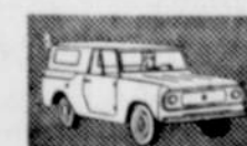
Same Scout converted in town delivery by an optional steel Travel-Top complete with windows and lift gate.

The Scout is INTERNATIONAL-built, backed by INTERNATIONAL service everywhere on every part. See us today and hit the trail to low-cost transportation!