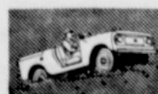
Same Scout stripped for action. For special duty, doors, windows lift off, windshield folds down or detaches.