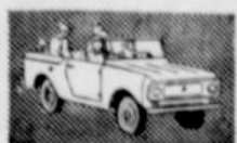
Same Scout with the roof off. Top is removed in minutes, to give you a vehicle for any kind of activity.