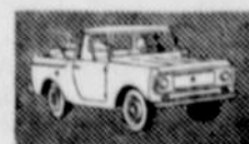
This is the Scout, a neat and nimble pickup. Small in size, light in weight. Fun to drive for business or pleasure.

The Scout offers full-width seating for three. Its steel top comes off in minutes. Its all-steel body hauls man-size loads of cargo, has extra seating on full-length wheel housings. An INTERNATIONAL 4-cylinder Comanche engine provides husky power, saves gas and oil. Optional all-wheel drive provides extra traction for work off-road, optional steel Travel-Top converts it into town delivery. There's never been anything like the Scout.