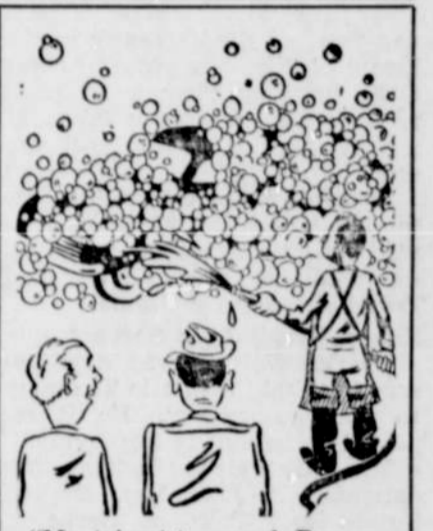
"Musta' got too much Duz-a in the water!"