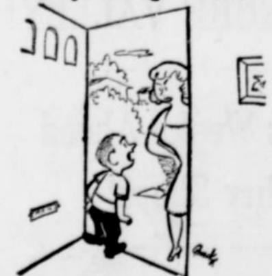
"If you're here about a broken window—my parents are away on a year's vacation."