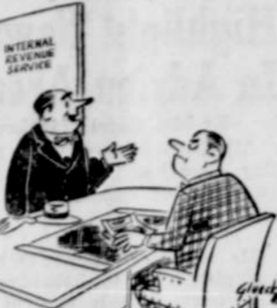
"I suppose you called me in to present me with a handsome refund?"