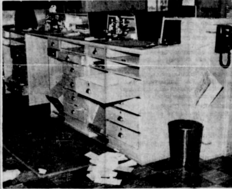
SHOWN ABOVE is the scene left by post office burglars early Sunday morning. Left foreground shows drawers used by clerks with evidence of forcible entry on those not unlocked. The upper drawer, middle row, is the one from which $42.18 was taken. On either side are the empty spaces where drawers had been removed and placed in the safe. Two rolls of stamps had been thrown into a waste basket.