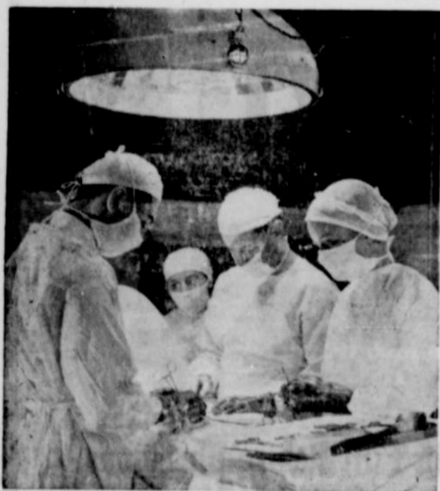
SURGEONS' BILLS American Republic Hospital, Surgical and Nursing Plans and the American Republic Medical and Surgical Plan help pay expensive surgeons' bills for operations.