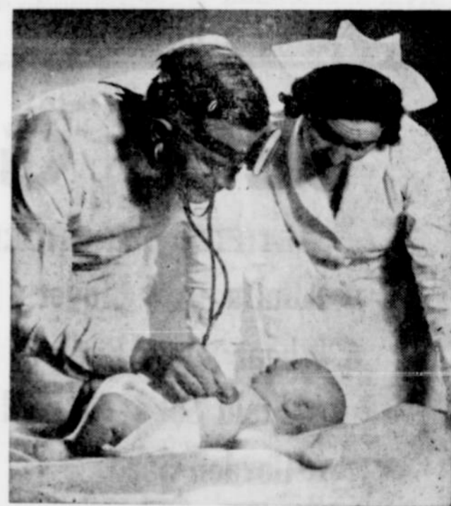
CHILDBIRTH American Republic Hospital, Surgical and Nursing Plans and the American Republic Medical and Surgical Plan help pay hospital and doctor bills for childbirth.