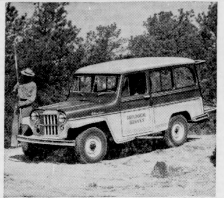
Jeep Utility Wagon