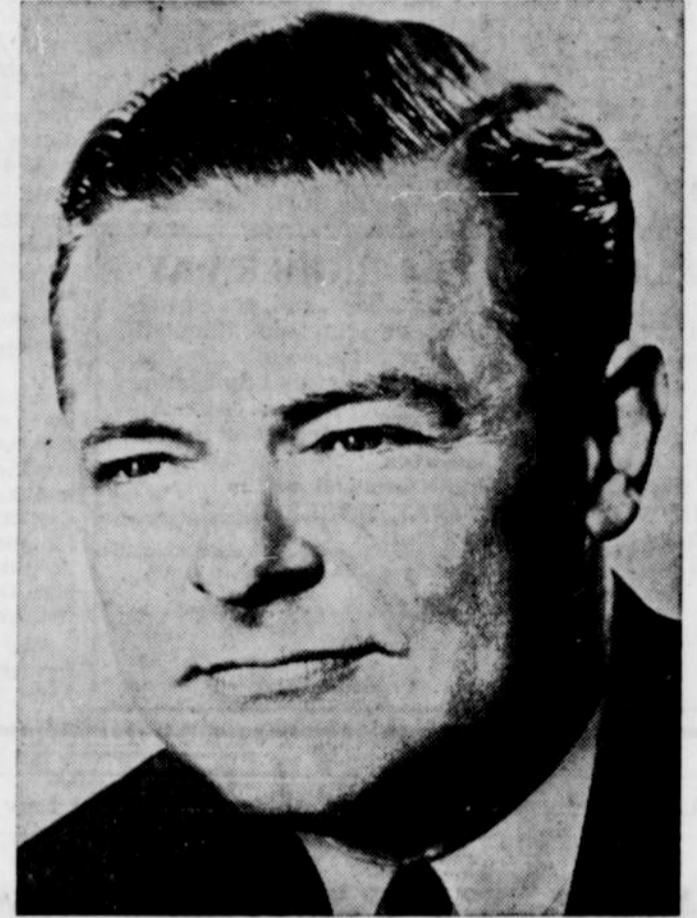
Henry Cabot Lodge For Vice President of the United States