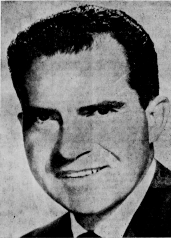
Richard M. Nixon For President of the United States