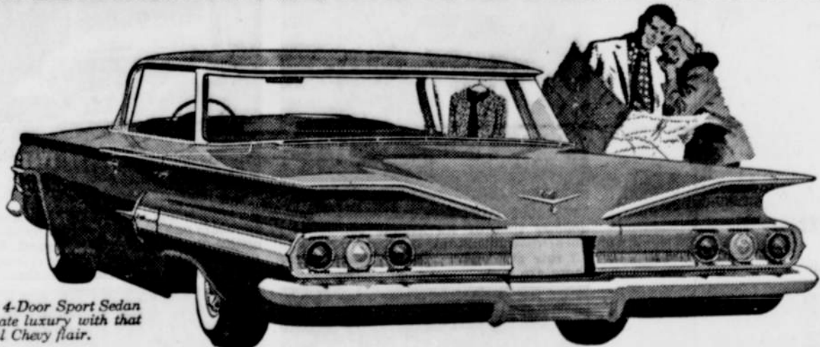
Impala 4-Door Sport Sedan—ultimate luxury with that practical Chevy flair.

Your Chevrolet dealer is getting ready right now for the new '61 models. He's making room for them this instant , with eye-popping deals on all 1960 models. And with a wide, wide selection to choose from now's the best-ever time to buy a new '60 Chevy and save money like mad!