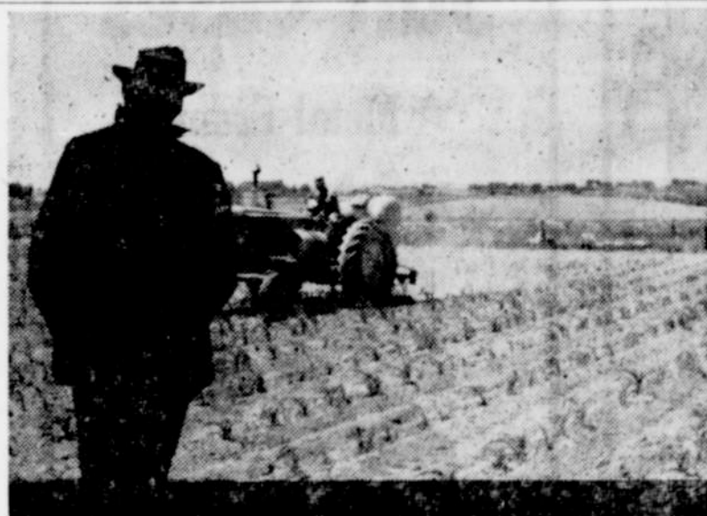
Farmer X Used 50 lbs. of 'N' on His Corn and Harvested 15 Tons of Silage per Acre