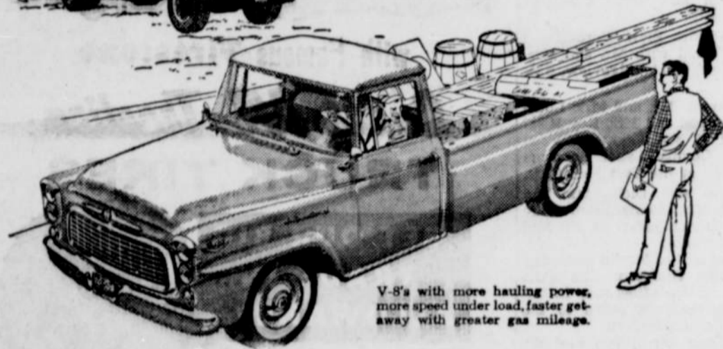
V-8's with more hauling power, more speed under load, faster get-away with greater gas mileage.