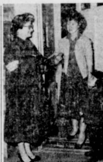
Two million mothers like this one will conduct a house-to-house door count this month seeking information and support for the New March of Dimes campaign against birth defects, arthritis and polio.

Mothers making the house-to-house door count will also seek contributions to the New March of Dimes for its attack on birth defects, arthritis and polio. The New March of Dimes is combating these disabling disorders with the same effective weapons used to conquer paralytic polio: medical scientific research to find causes, cures, preventives; patient aid for medical care; and training for medical workers needed to treat the sick and disabled.