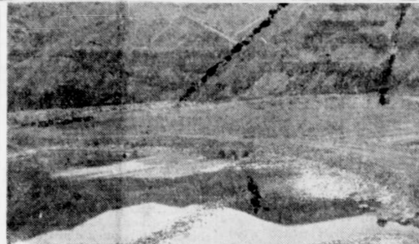
The new span is of particular significance in view of the new park being built at the lake and the development of the new Owyhee lake resort.

THE RECENTLY completed span across the Owyhee river, just 22 miles from Nyssa on the road to Owyhee dam is pictured above. The bridge is one span of the old Snake river highway bridge at Nyssa. Planking and stringers were purchased by the Isaak Walton league which moved the bridge to its new site. The new bridge was erected to replace the fill shown on the right. It will allow year-around traffic to the lake on the gradual grade up the canyon which has usually been closed in the early spring by high water. Even later in the season the road has frequently been hazardous before culverts could be installed in place of the ford.