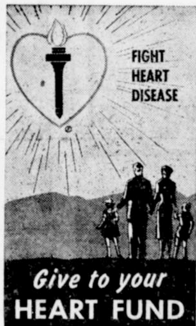
Give to your HEART FUND