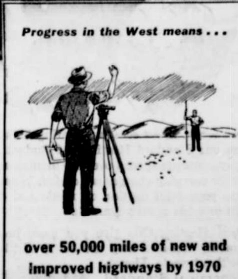
over 50,000 miles of new and improved highways by 1970

To help bring you more miles of superroads faster and at lowest cost, Standard* operates nine asphalt refineries across the nation. Our scientists work with highway engineers on improved construction and low-cost maintenance methods that can make asphalt highways even better and stronger after years of service.