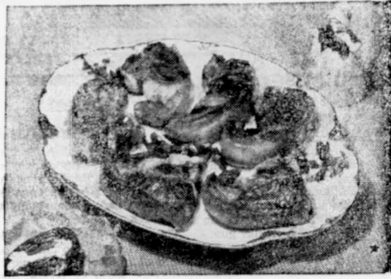
Juicy, broiled lamb chops and a fruit heart-shaped salad provide an easy and yet distinctive Valentine menu suggestion.

Special menus for special days for special people. . . Valentine's Day is such a time and here is such a menu.