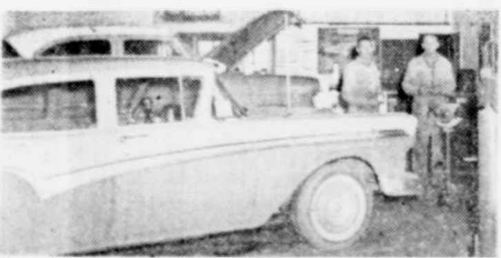
Expert Mechanics and Modern Equipment Assures You the Finest In Service.