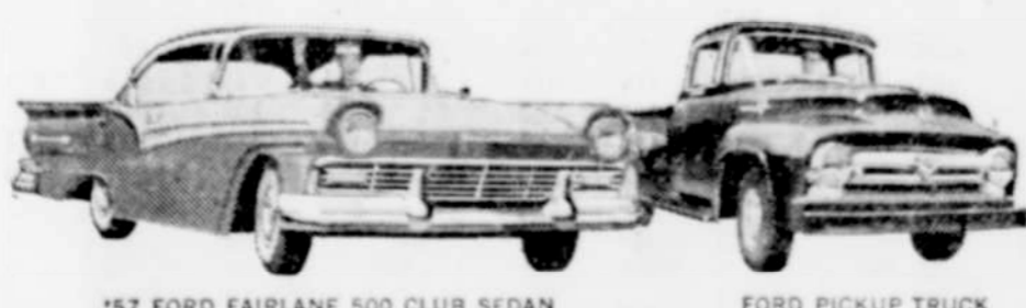
'57 FORD FAIRLANE 500 CLUB SEDAN FORD PICKUP TRUCK

Ford Division of Ford Motor Company is happy to welcome this new dealer to the nationwide Ford Dealer family. And there's a warm invitation for you to stop in and get acquainted with this friendly group of automobile men. They will be glad to have an opportunity to show you their fine facilities. And they'll be particularly happy to have you see the new kind of Ford for '57. It's the car with the Touch of Tomorrow . . . startlingly beautiful—daringly different—and new, brand-new, right from the ground up. Then take one of the great new Fords out for a test drive. When you feel its so-much-smoother ride . . . and the way any one of the terrific new Ford engines powers this longer, lower Ford down the highway . . . you'll know right away that you want Ford's Touch of Tomorrow . . . TODAY!