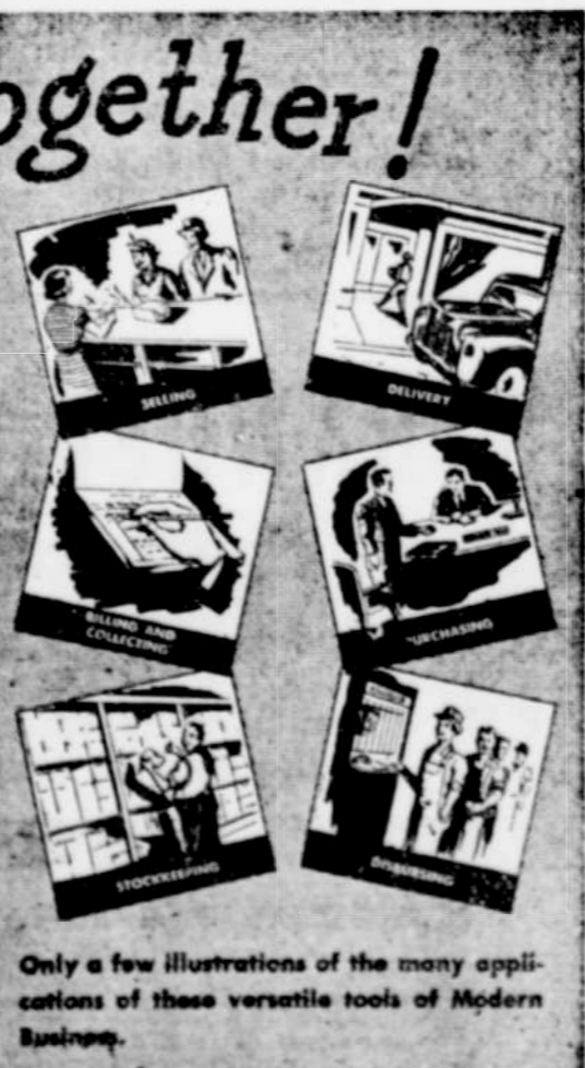
Only a few illustrations of the many applications of these versatile tools of Modern Business.