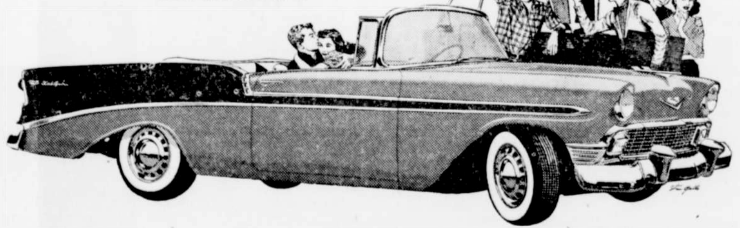
The new Bel Air Convertible—one of 20 sassy-styled new Chevrolets.

Want to take the wheel of one of America's few great road cars? Want to send pleasant little tingles up and down your spine? Then hustle on in and try out a new Chevrolet V8!