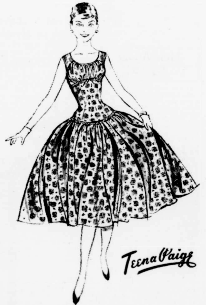
Tile Print Style 8265

Shirred empire bodice Torso dress of Bates Disciplined printed cotton. Lace tating trims empire and torso line. Washable and crease resistant. Full skirt and self belt. Blue, green or mauve print on white ground.