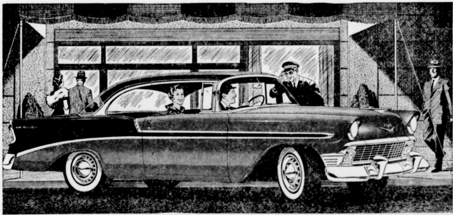
THE NEW BEL AIR SPORT COUPE

Who wouldn't mistake this new Chevrolet for a high-priced car! It looks strictly "upper bracket" with its bold new Motoramic styling... its longer, lower hood... its proud new full-width grille. But, even beyond the costly appearance of its beautiful Body by Fisher, Chevy gives the high-priced cars a run for their money. It brings