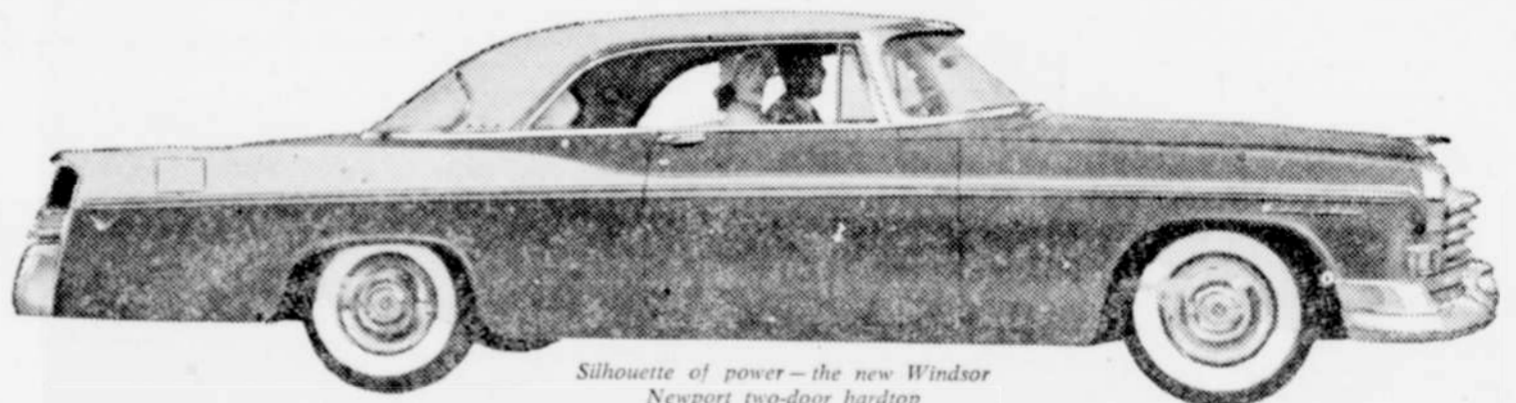
Silhouette of power—the new Windsor Newport two-door hardtop