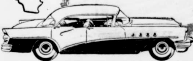
Buick's New Hardtop Hit — The 4-Door Riviera