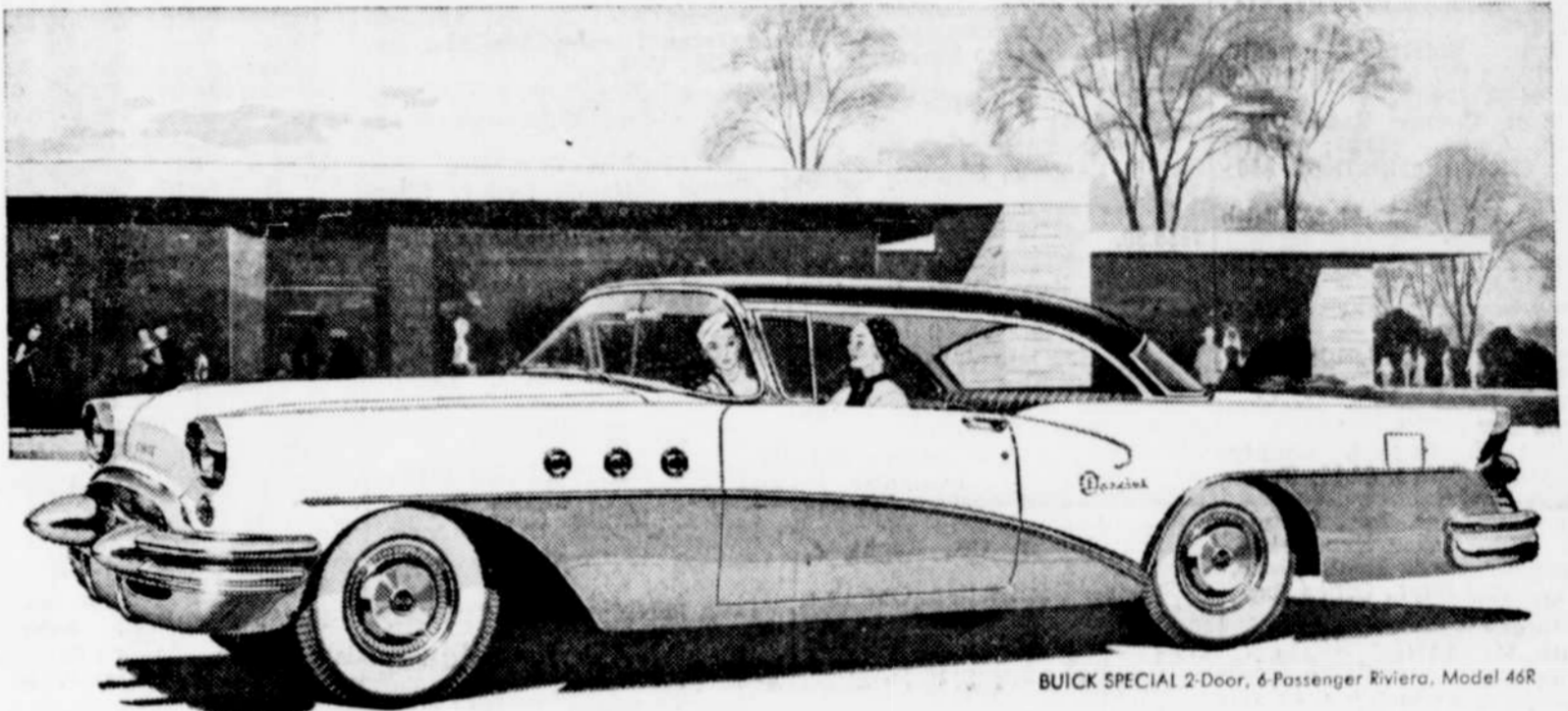
BUICK SPECIAL 2-Door, 6-Passenger Riviera, Model 46R