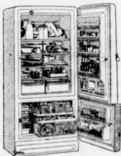
MODEL LH-14 M