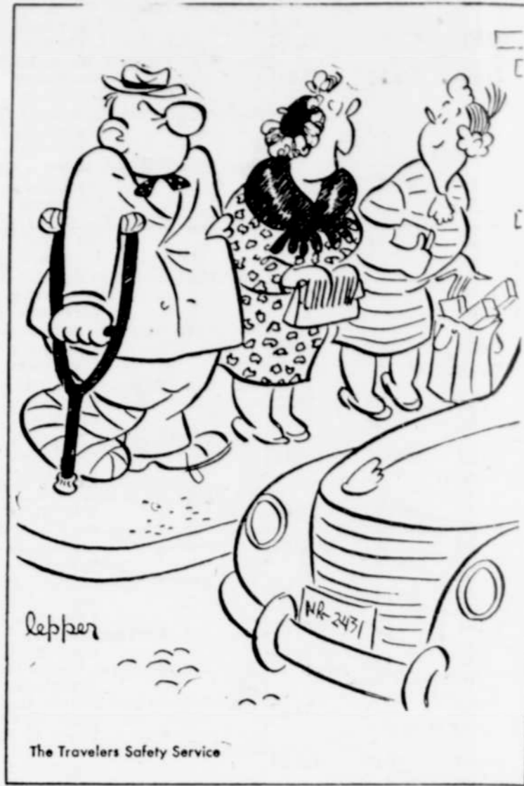
"It's getting to be kind of a little game with Fred—so far, he's been hit by Connecticut, Vermont, New York and Oklahoma drivers!"