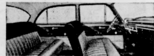
Style-Setting Interiors in Ford give you beauty from the inside out with colorful new upholstery and trim.