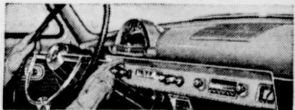
New Astra-Dial Instrument Panel is a safety dividend with speedometer placed high on the panel.