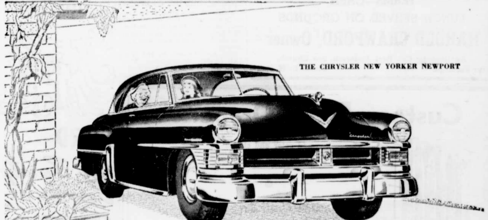
THE CHRYSLER NEW YORKER NEWPORT