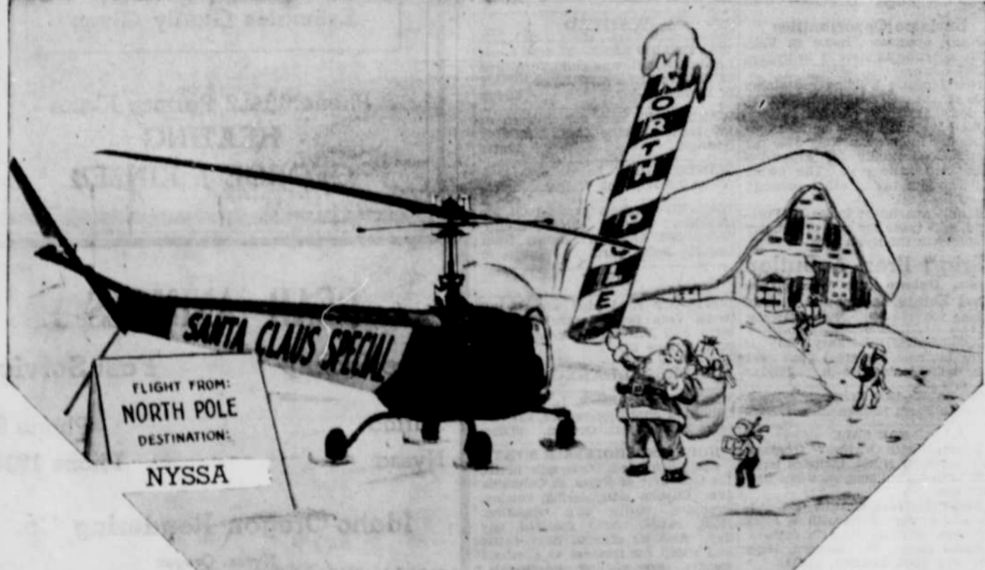
Santa Claus' Helicopter is ready for his 1951 excursions.