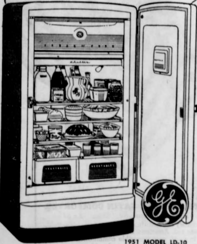
1951 MODEL LD-10 REFRIGERATOR

A big, de luxe 10.8-cu-ft G-E REFRIGERATOR for the price of an 8!