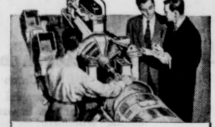
When you come to check the field you'll find that there's a sweet freedom from roughness to this engine's operation—tracing to the fact that the whole mechanism itself is engineered smooth, and the further fact that every Fireball Engine gets a Micropoise balancing after assembly.

No other type of engine has ever been used in a Buick—which means that Buick owners, all along, have