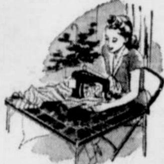
Mother draws out a table, so handy for quick pressing and cleaning jobs; for sewing and packing.