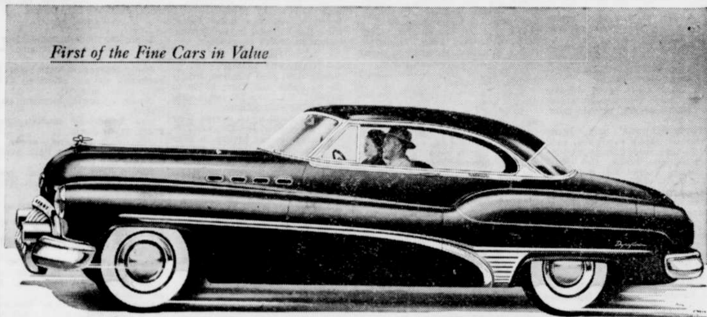
First of the Fine Cars in Value