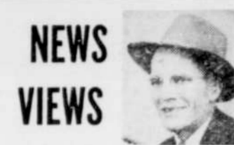
BY LEW HERRIMAN

The nation is now up to its ring finger in that annual matrimonial sweepstakes listed under "June Brides". We never could figure out exactly why June is such a heavy traffic month in the middle aisle department. Maybe it's because it's the climax of the Spring and just before the Fall... or it may be that many people don't like to take their vacations alone. Anyway, it's the ocean blossom and flowing gown climax for the nation's dew-eyed brides. Bridegrooms also figure in the ceremony, but if you read the fashion columns you get the idea they're lucky to be in the supporting cast. A Newspaper headline reads, "Dollar Lack Top Problem, Experts say". That's one of the sagest observations we've ever heard from an expert. Take the word of the experts. You just can't beat the Fifty For for good looks and smooth performance. It's fifty ways new. And once you try it you'll be convinced it's the car for you. Drop in for a demonstration to HERRIMAN MOTOR CO. Phone: 77.