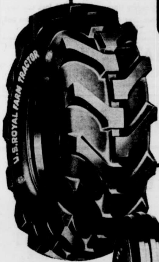
U. S. ROYAL FARM TRACTOR TIRE for rear wheels