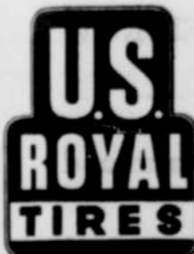
U. S. ROYAL GROUND DRIVE TIRE for ground driven implements

STEEL WHEEL CUT DOWN CHANGE-OVERS! Get the benefits of rubber mounted Spreaders, Plows, Wagon and other implements.