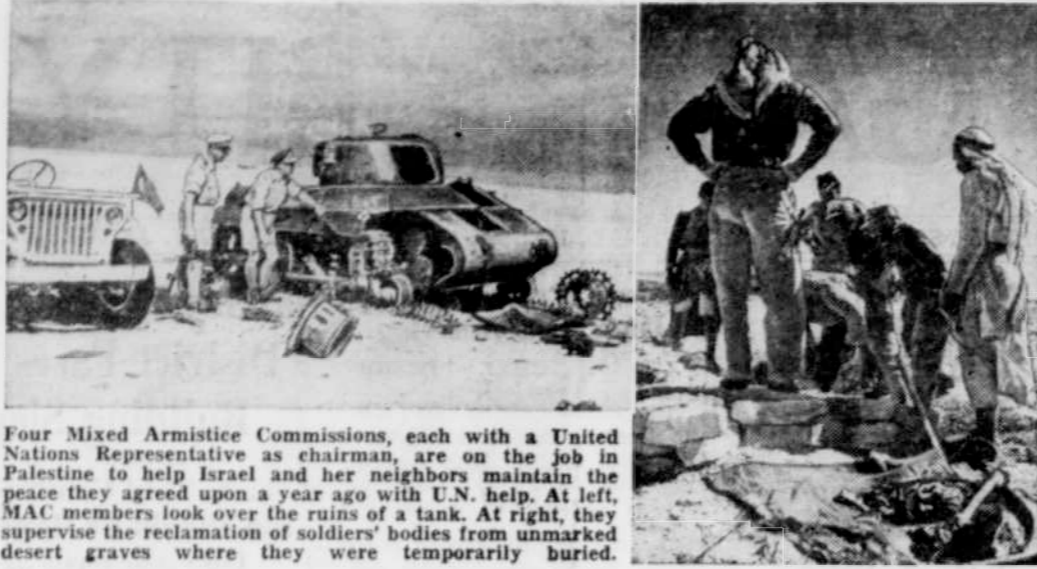
Four Mixed Armistice Commissions, each with a United Nations Representative as chairman, are on the job in Palestine to help Israel and her neighbors maintain the peace they agreed upon a year ago with U.N. help. At left, MAC members look over the ruins of a tank. At right, they supervise the reclamation of soldiers' bodies from unmarked desert graves where they were temporarily buried.