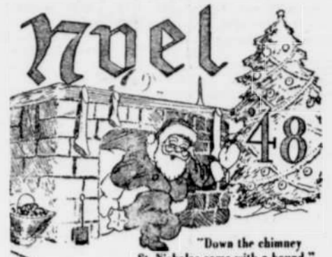
"Down the chimney St. Nicholas came, with a bound."