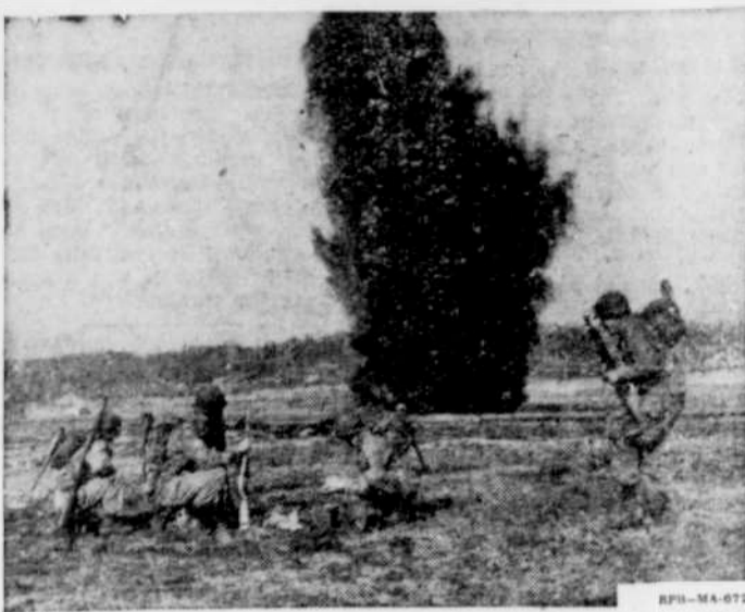
This 11th Airborne Division demolition crew in Japan has just detonated a charge of explosives in blowing up a bridge during tactical training courses. These men are receiving the finest training available, and will become efficient, well-trained soldier-specialists. Men on occupation duty, as well as elsewhere, have excellent opportunities for careers with a future in the U. S. Army.